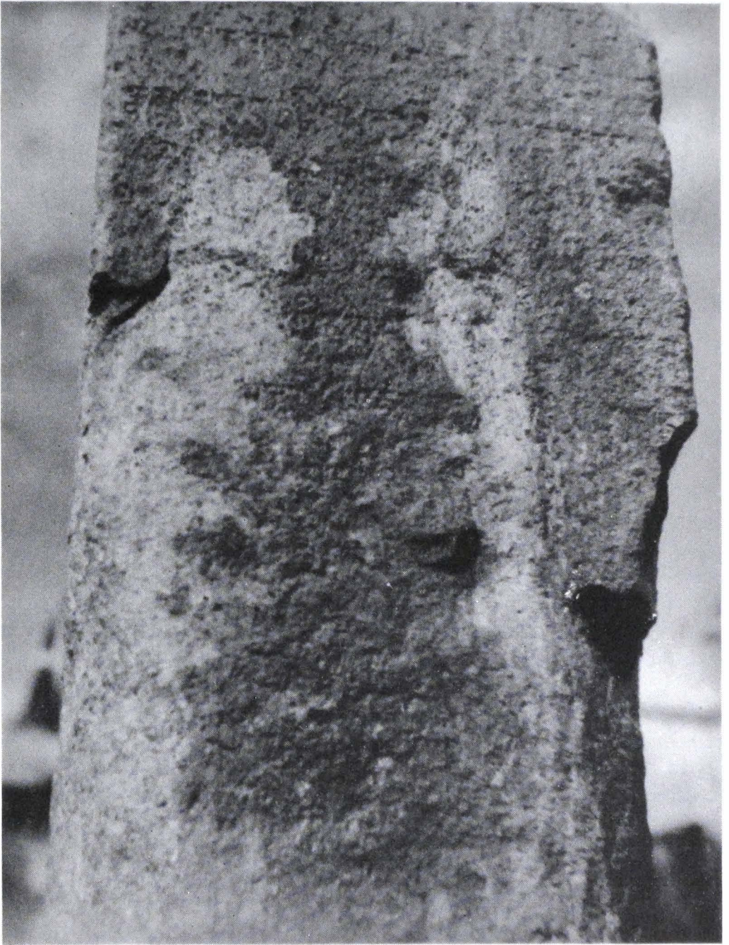
East face, lower half.